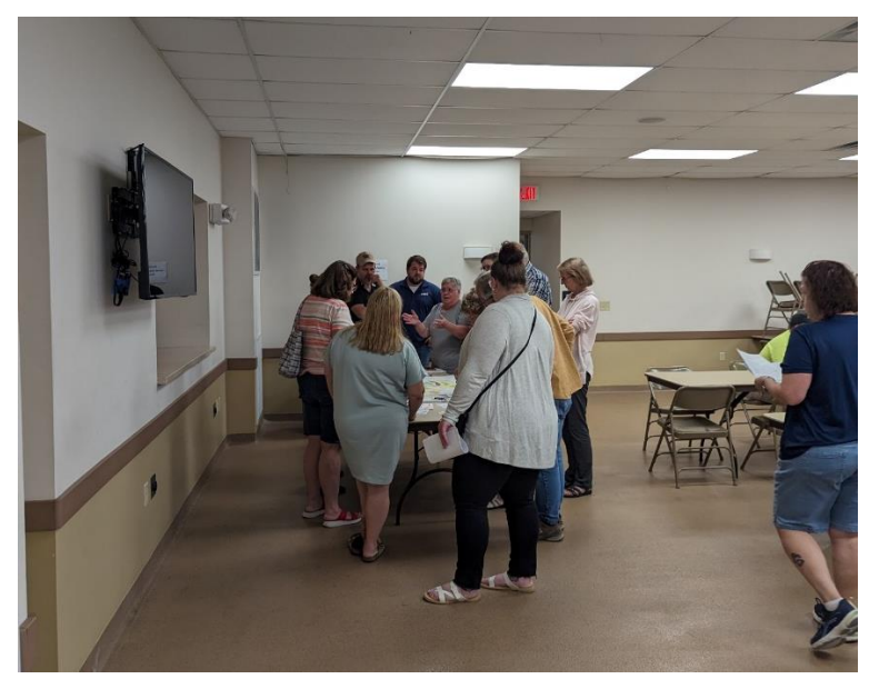
Future land use mapping in action (7PM Meeting)