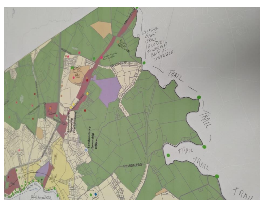
Example of comments on Land Use Map