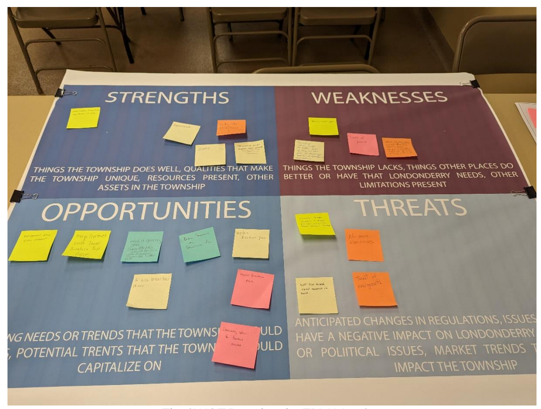
The SWOT Board at the 7PM Meeting

Participants at the Strengths, Weaknesses, Opportunities, and Threats (SWOT) Station shared what strengths Londonderry could build upon or maintain, what weaknesses the Township needs to overcome, what opportunities existed to capitalize on, and what could possibly present a threat to the community in the future. The results from both meetings are separated and grouped below: